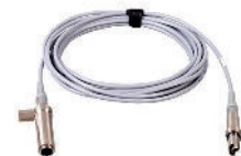
SC 91A Microphone Extension Cable