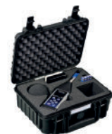
SA 72 Waterproof carrying case