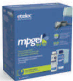
bottles in 2 sizes