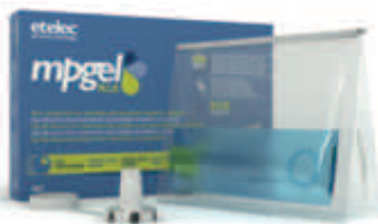
bags in 4 sizes