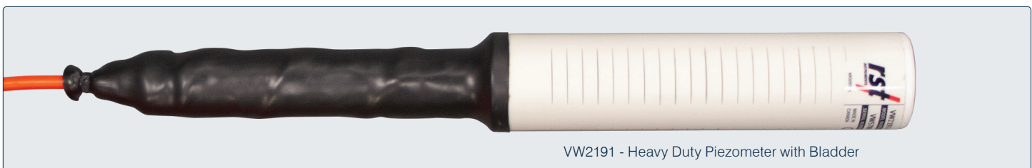
VW2191 - Heavy Duty Piezometer with Bladder