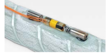
Model 4151 Strain Gauge mounted to a fiberglass rebar.