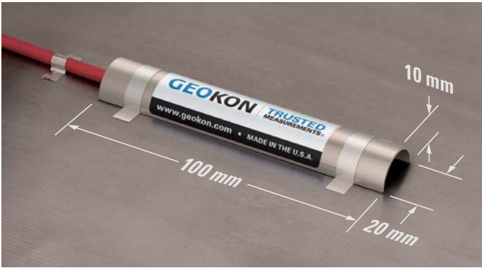
Model 4150 under the Model 4150-1 protective cover plate, with dimensions.