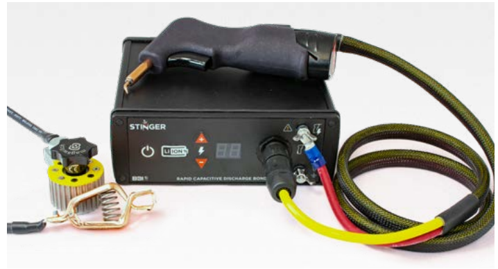
Model 4100-WLD Stinger spot welding kit.