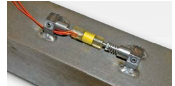
Model 4150 shown with optional arc-weldable mounting blocks.

Accessories include setting tools, capacitive discharge welder (for spot welding) and epoxy kits (for bonded applications).